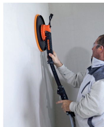
Lower rotation speed → for a perfect surface structure